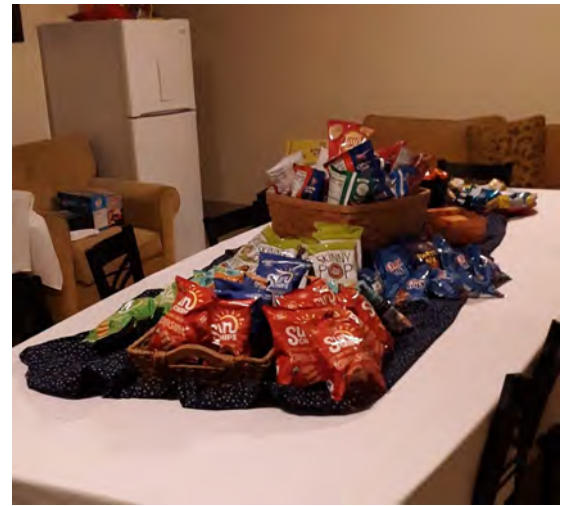
Hospitality room: laden with goodies and awaiting those who wanted a break.