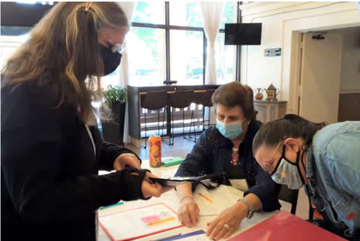
First things first: checking in at the registration desk.