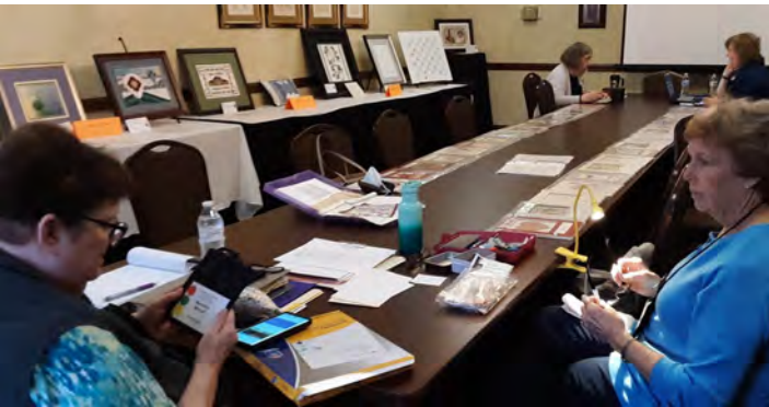
Seminar office: where the exhibits lived and business got done.