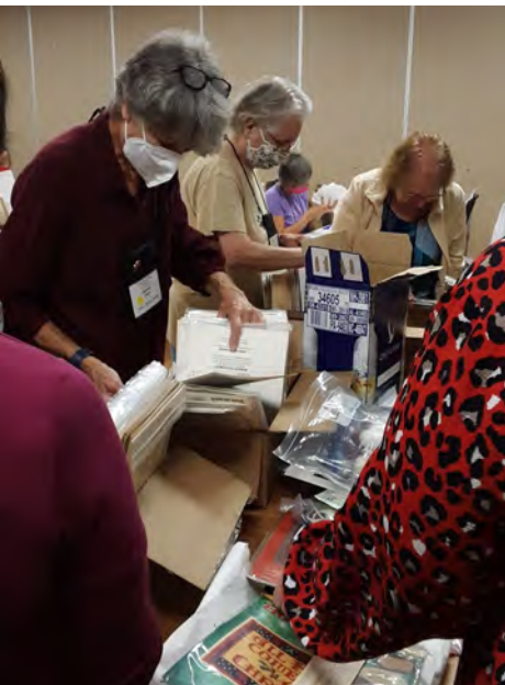
Stash give away table: a very popular place!