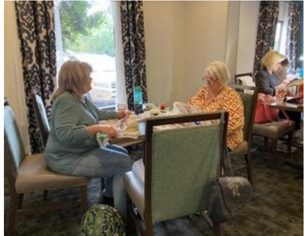
Attendees enjoyed having the chance to sit and stitch and chat.....