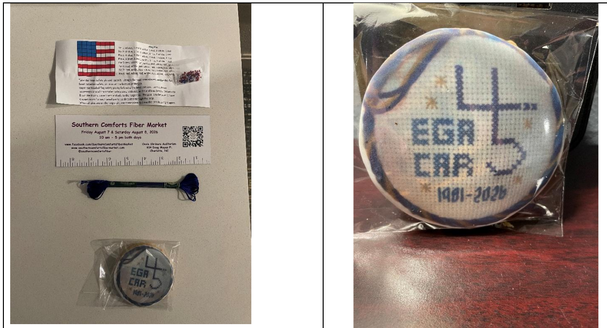
All attendees were given a few “welcome” gifts:

We just got back from a wonderful, friendly, and educational stitching weekend at the CAR Spring Retreat! The Florence chapter volunteered to plan and host this event, centered around the theme of celebrating America's 250 th anniversary. Many people were stitching patriotic designs. What fun!